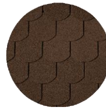
2 Tone Brown